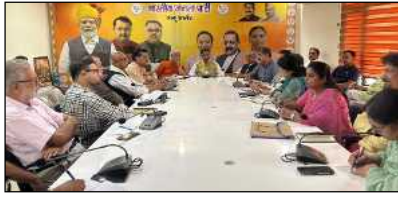
JAMMU, JUNE 8