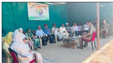
REASI, JUNE 8

Demonstrating its unwavering commitment towards the welfare of the veteran fraternity and their families, the Indian Army organised an interaction programme with Ex-Servicemen and Veer Naris at Dharmari in the remote and mountainous region of Reasi district, Jammu and Kashmir.