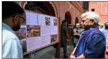
of 11 buildings at the heritage complex is underway, with nine to 10 projects expected to be completed by March 2027. Mubarak Mandi, located in the heart of the old walled city overlooking the

JAMMU, JUN 8 : Jammu and Kashmir Lt Governor Manoj Sinha on Monday visited the Mubarak Mandi heritage complex in old city here and also inspected the damage caused to an ancient temple in its close vicinity. Accompanied by Chief Secretary Atal Dulloo, the Lt Governor reviewed the ongoing restoration and conservation works at the heritage complex and the temple. A portion of the wall of the nearly 200-year-old Gadadhar temple collapsed outside the Mubarak Mandi heritage complex on June 4 following rain, triggering concerns among locals who blamed the ongoing excavation and restoration work near the shrine for the collapse. Talking to reporters, Dulloo said renovation