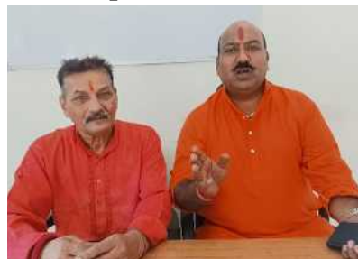
JAMMU, JUNE 8