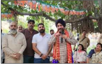
JAMMU, JUNE 8